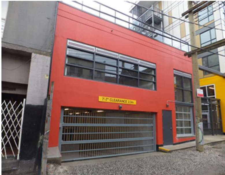
Strata EPS 3084