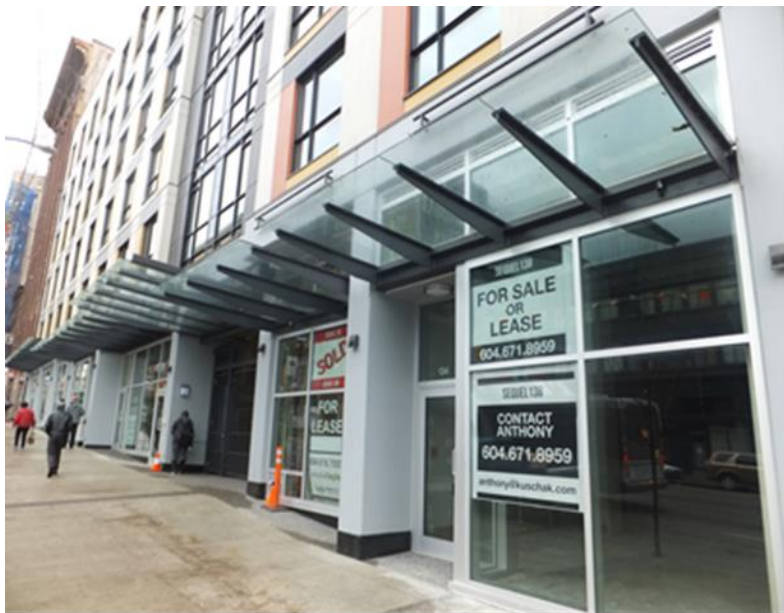
Strata EPS 3084